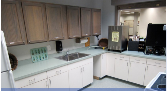
Refreshments may be brought in or provided by your choice of caterer.